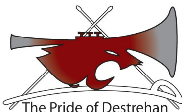
The Pride of Destrehan

The Pride of Destrehan is having a blanket drive to support the Humane Society of St. Charles Parish. If you or someone you know have old blankets and towels that you wish to get rid of please have them donated to our cause. We want to protect animals from the harsh cold this winter. Please bring your donations to the band room and place them on the shelf. Someone will take them from there and deliver them to the shelter for use. WE THANK YOU FOR YOUR HELP!